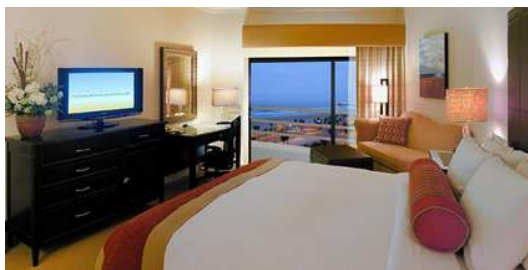
Ocean View King Room

Make sure to visit www.EZWRUG.org soon to register for the conference and reserve a room!